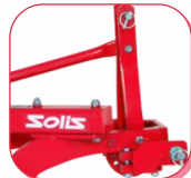
HEAVY DUTY 3 POINT LINKAGE