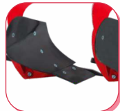
LONG LASTING HEAVY DUTY BLADE & BAR POINT