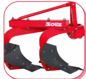
HEAVY DUTY FURROW