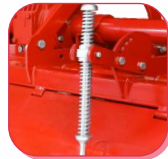
FLEXIBLE & ADJUSTABLE TRAILER SPRING