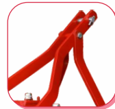
ROBUST 3 POINT LINKAGE