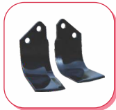
INTERNATIONAL QUALITY BORON STEEL ANTI WEAR BLADES