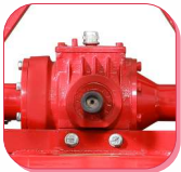
HEAVY DUTY GEARBOX COMPATIBLE WITH HIGHER HP TRACTORS UP TO 90HP